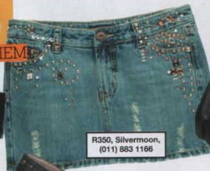
R350, Silvermoon, (011) 883 1166