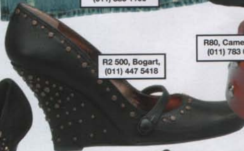
R2 500, Bogart, (011) 447 5418