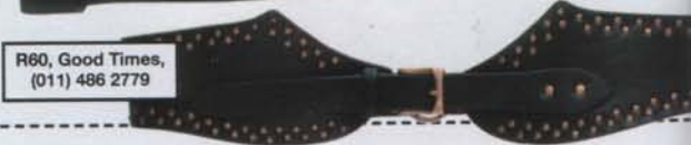
R60, Good Times, (011) 486 2779