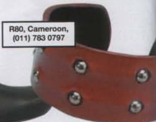
R80, Cameroon, (011) 783 0797