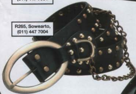
R265, Sowearto, (011) 447 7004