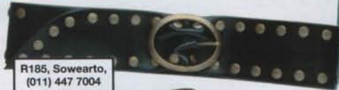
R185, Sowearto, (011) 447 7004