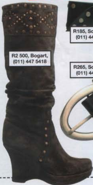
R2 500, Bogart, (011) 447 5418