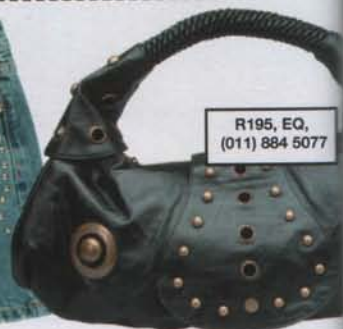
R195, EQ, (011) 884 5077