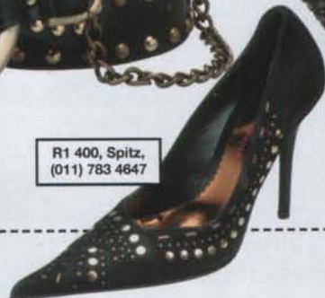
R1 400, Spitz, (011) 783 4647