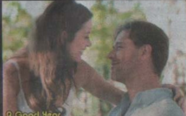
A Good Year