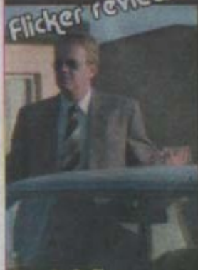
Catch A Fire