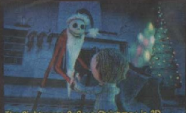
The Nightmare Before Christmas in 3D