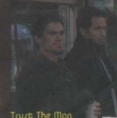
Trust The Man

FREE fortnightly at 151 locations from Bunbury to Margaret River + select met